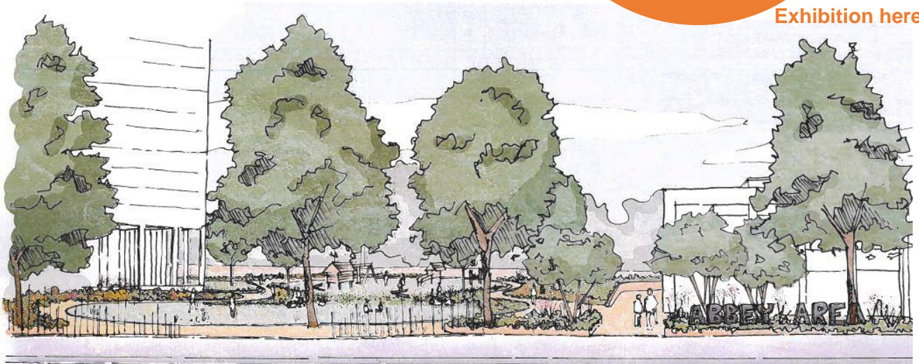
Impression of the proposed new view from Belsize Road