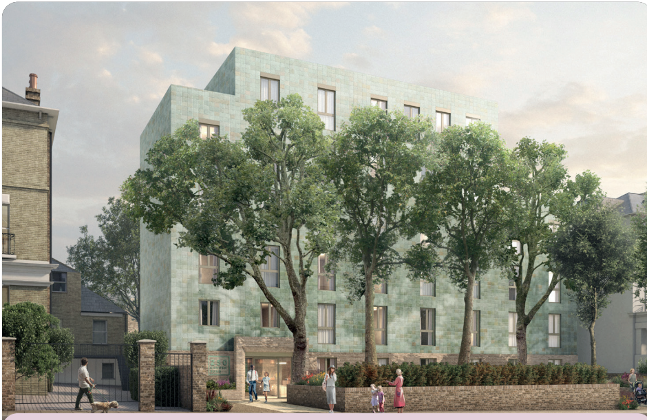
Computer generated image of how the building may look like

Information and updates from Camden Council