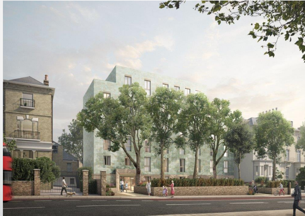
CGI of the 248 – 250 Camden Road