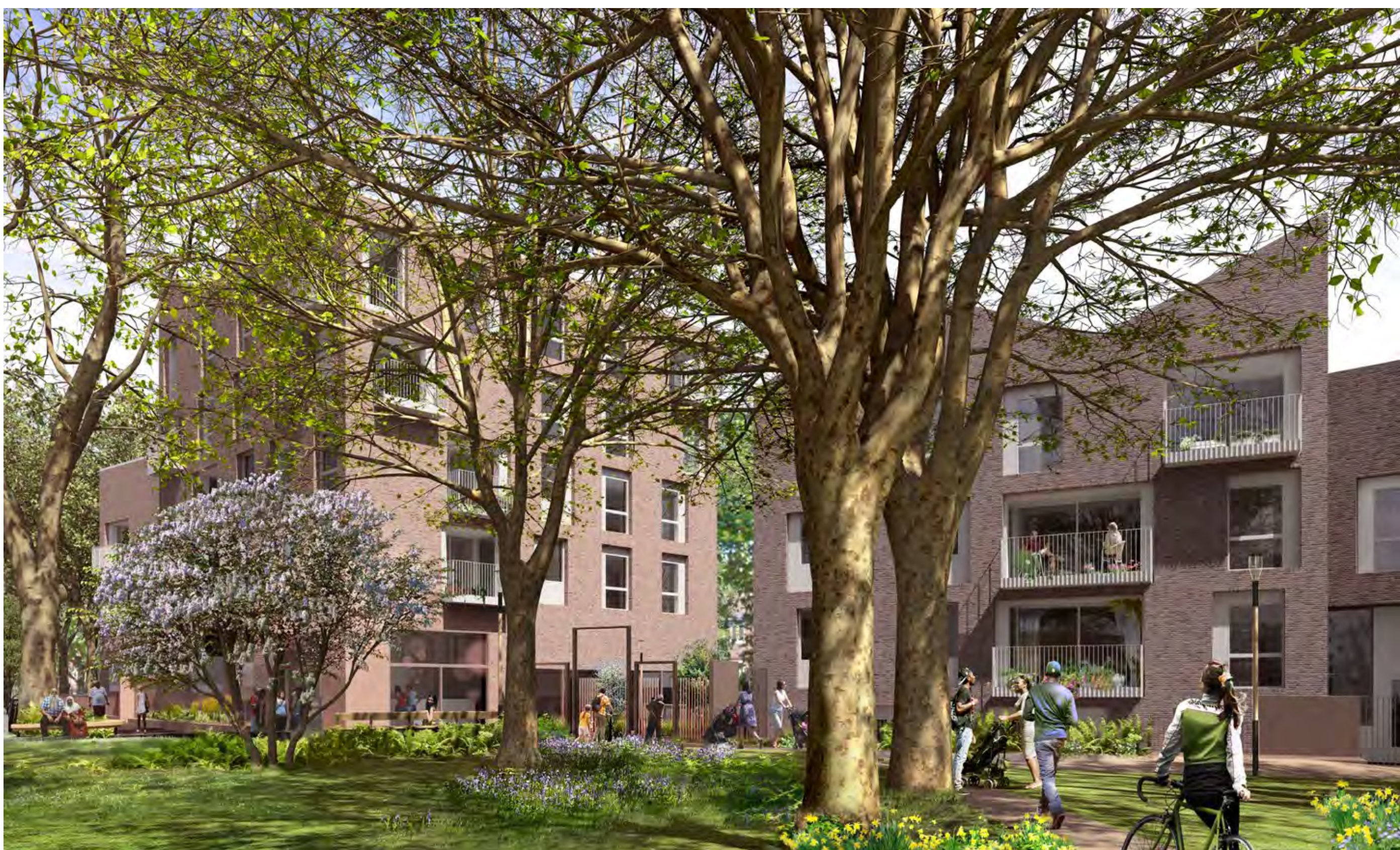
3 View of Plots 5 and 6 from northern end of Purchase Street Open Space

Planting beds provide a buffer to the residential units and lightwells on the lower storeys of the residential block. New seating adjacent to the entrance of the community hall will be provided.