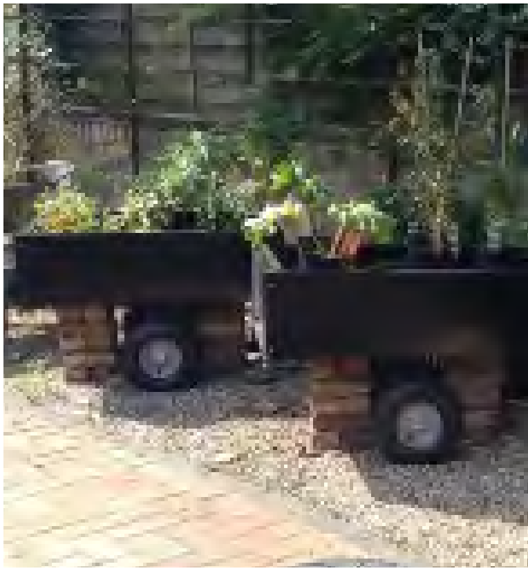
b Raised Community Garden Planters