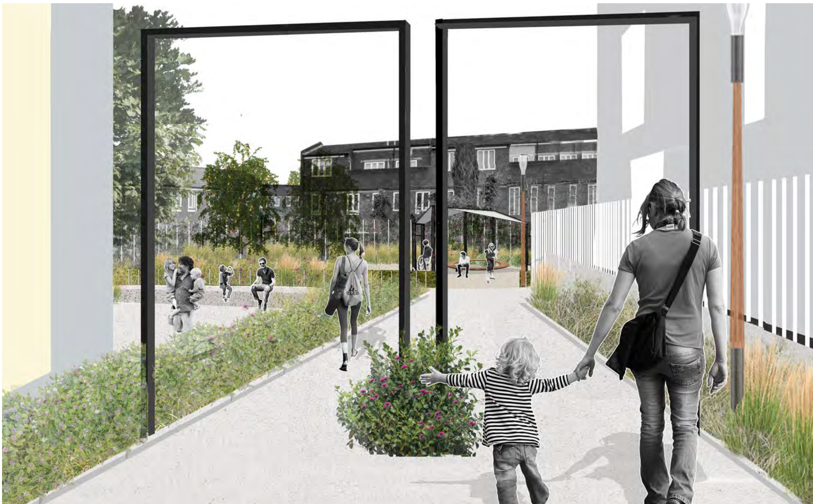
2 View of Entrance to Community Garden

A gateway to the community garden announces it's presence in the courtyard between plots 5 and 6. These black metal portal frames provide a secure boundary when the garden is closed yet announce a civic welcome when they are open during the day.