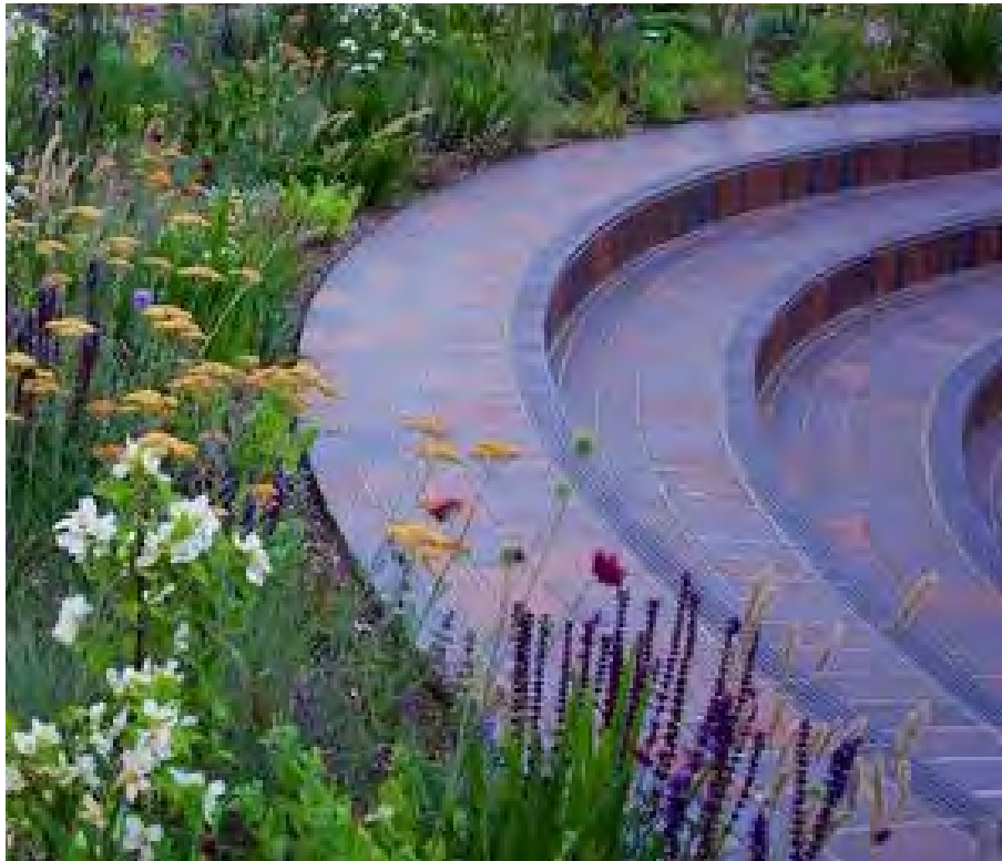
g Low Brick Wall Planter Edge and Seating