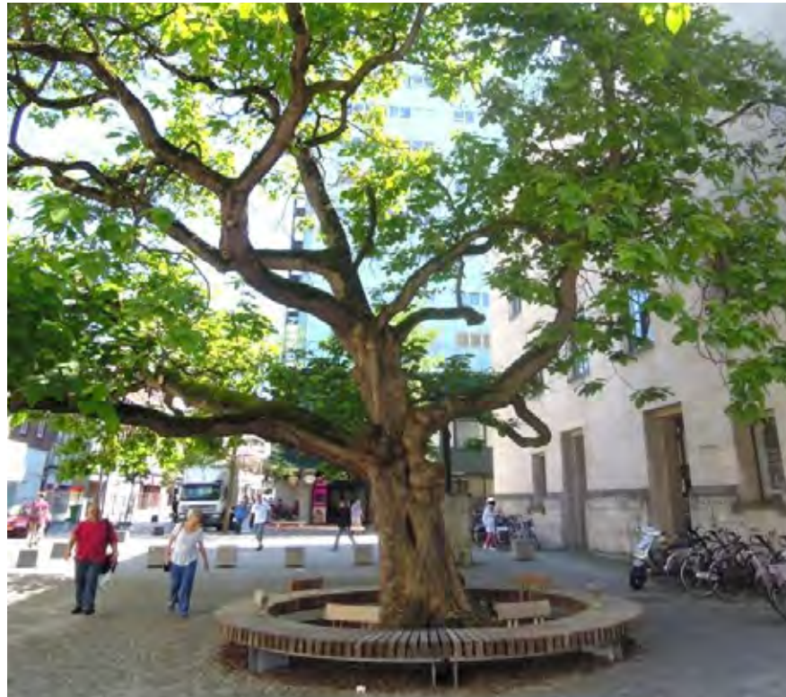
h Feature Seating - Circular Tree Base