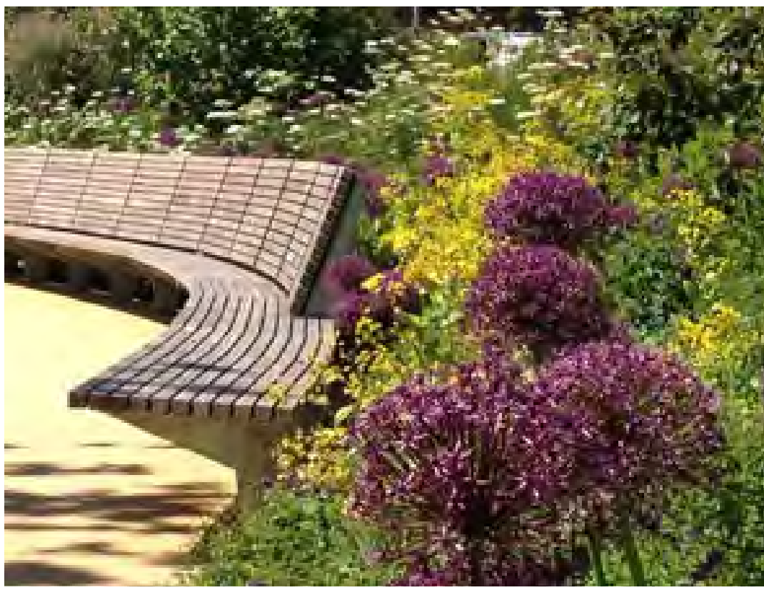
c Seating Edge with Planting Bed behind