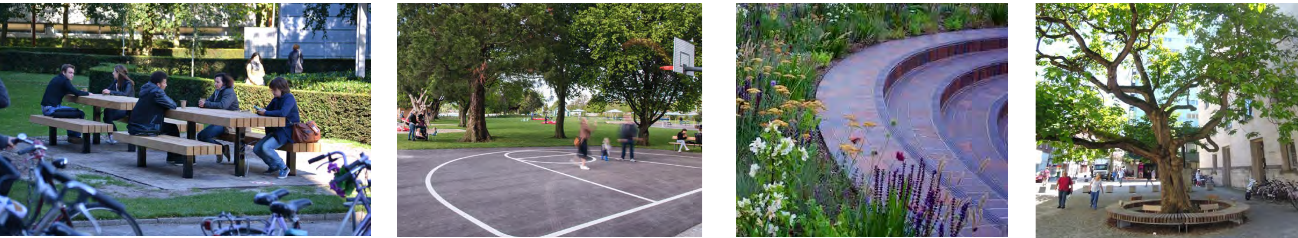
(e) Social seating - Picnic Tables (f) Ball Court Area (g) Low Brick Wall Planter Edge and Seating (h) Feature Seating - Circular Tree Base