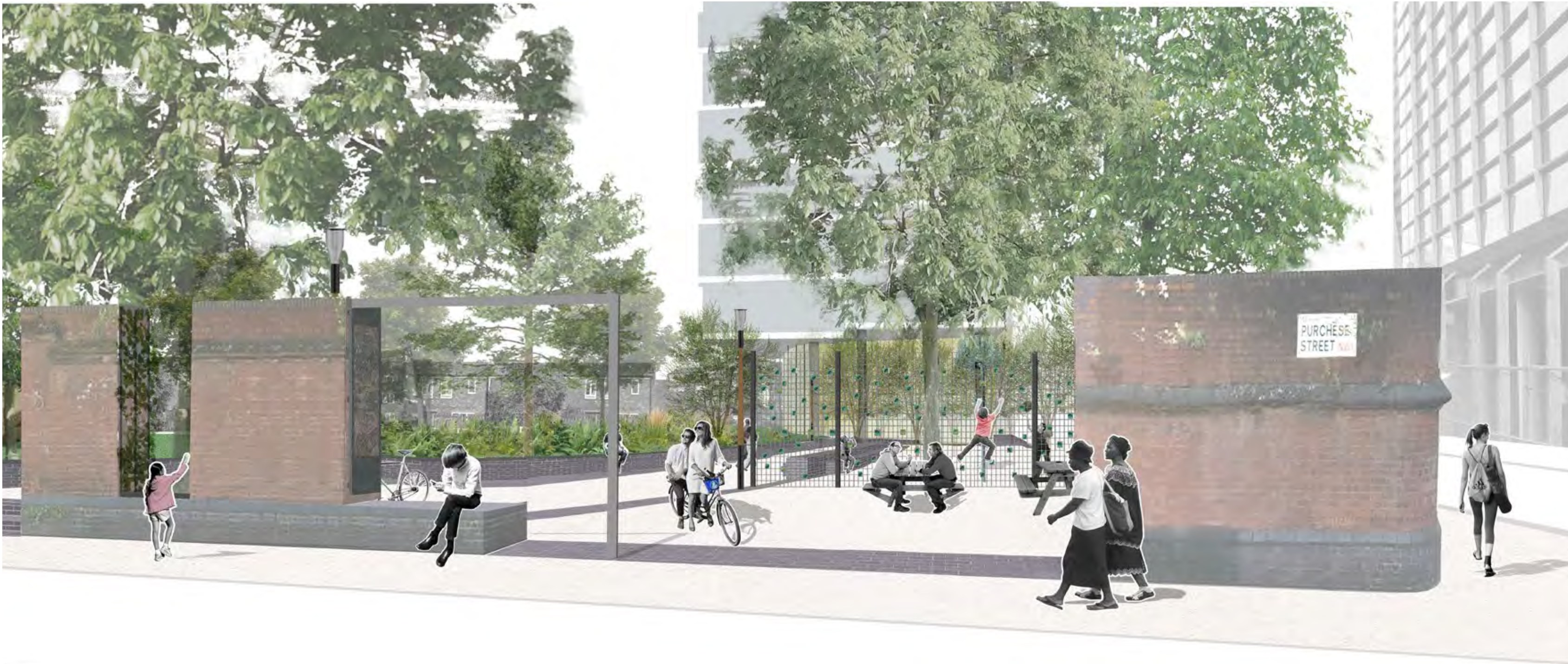
1 View from Purchase Street

A new entrance gateway formed in the existing wall on Purchase Street leads into a new social space for the park. Sections of the existing wall will be removed to increase the visual permeability into the park from Purchase Street. Bands of engineering brick will mark the position of sections of walls that have been removed.