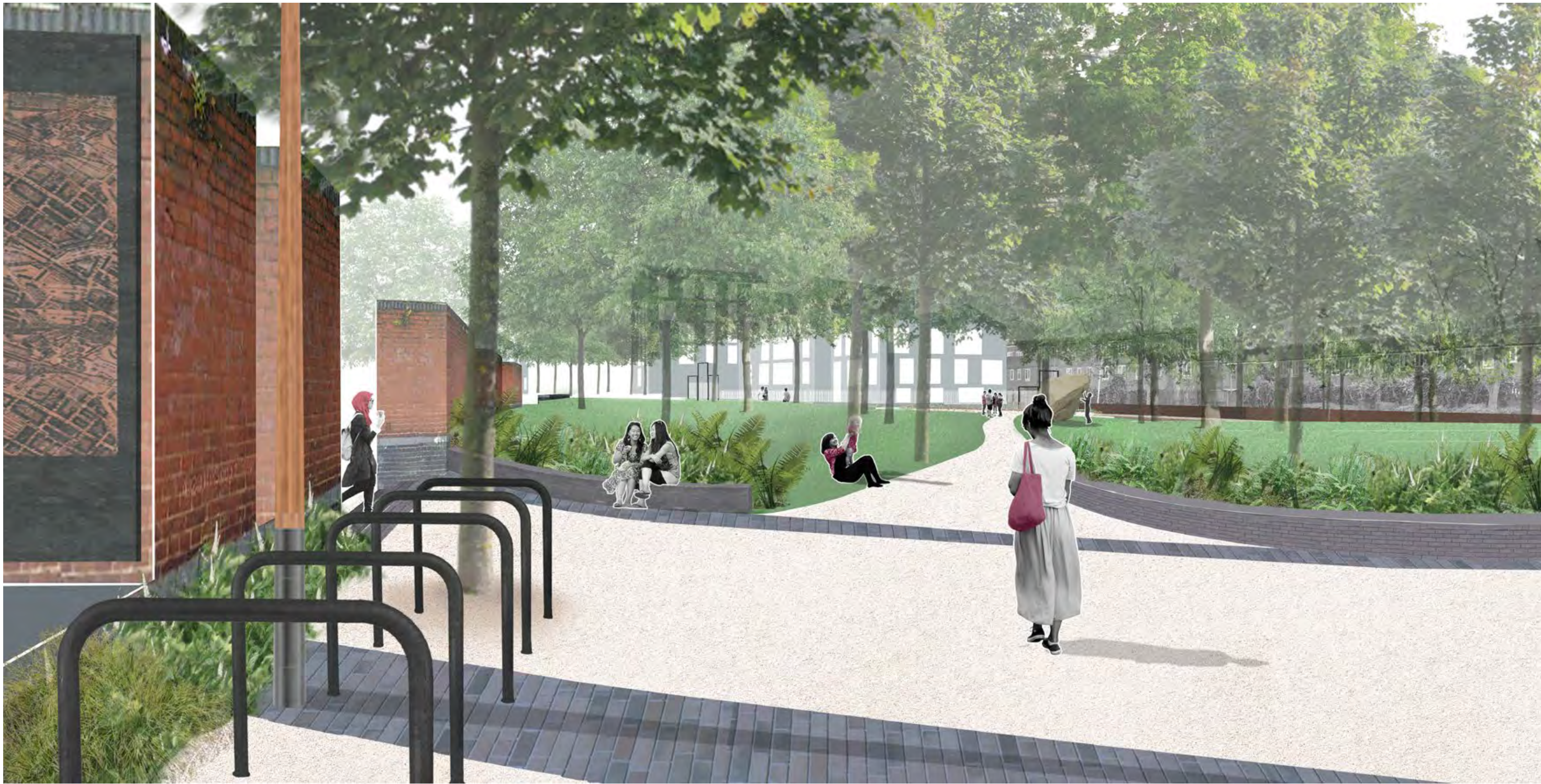
2 View from Brill Place Gateway

This view looks north from the corner of Brill Place and Purchase Street. Low brick wall edges and picnic tables provide informal seating areas next to planting beds and newly planted trees.