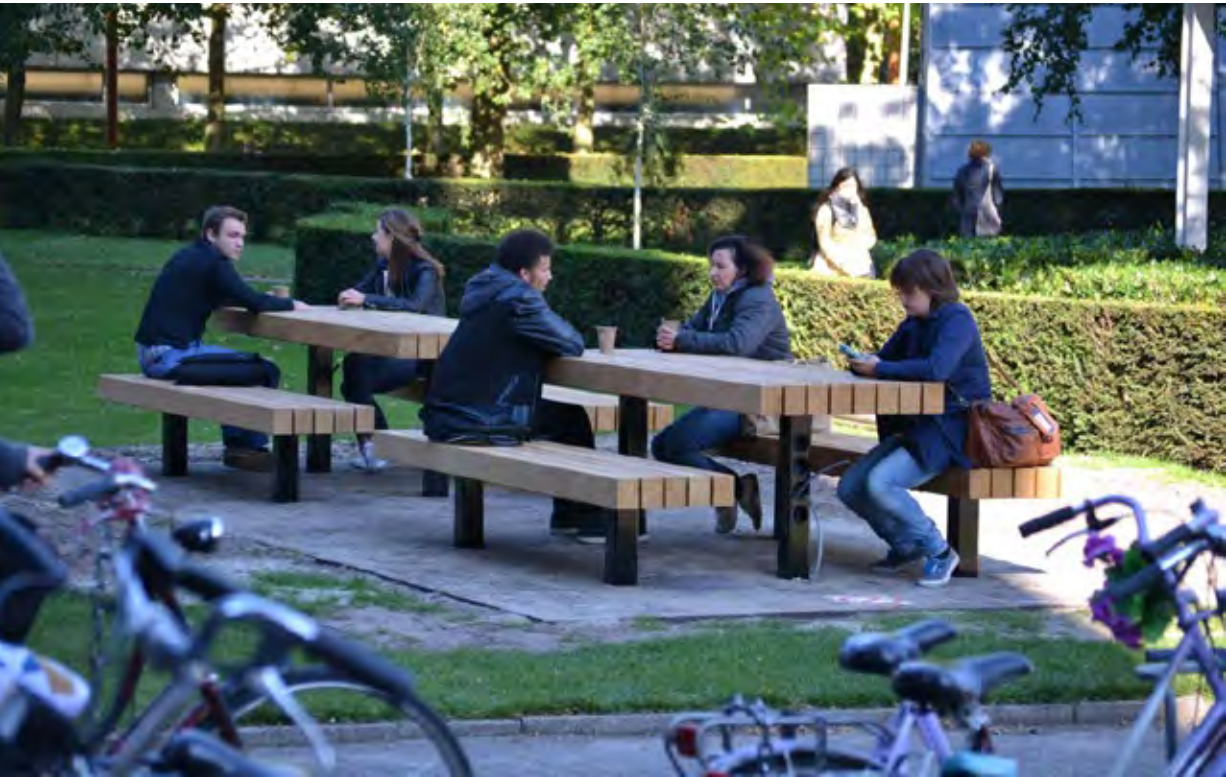
e Social seating - Picnic Tables