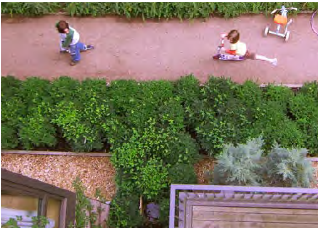
f Buffer planting to thresholds and edges