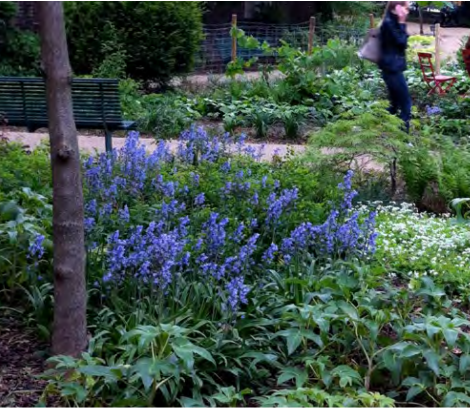
a Woodland bulbs and groundcover planting