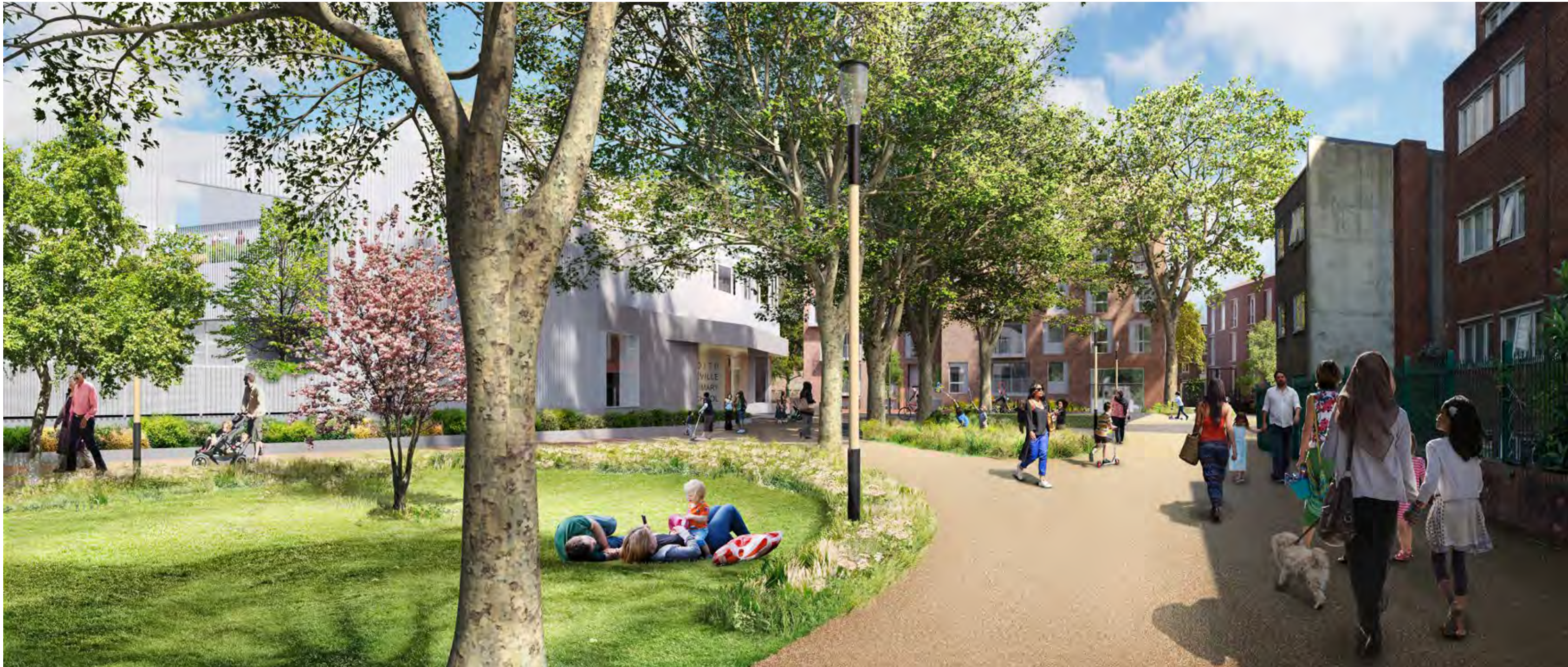
1 Proposed view towards Plots 5 and 6 from Polygon Road Open Space

The entrance to the Community Gardens will be connected to the proposed improved Polygon Road Open Space by the planned community square in front of Edith Neville School.