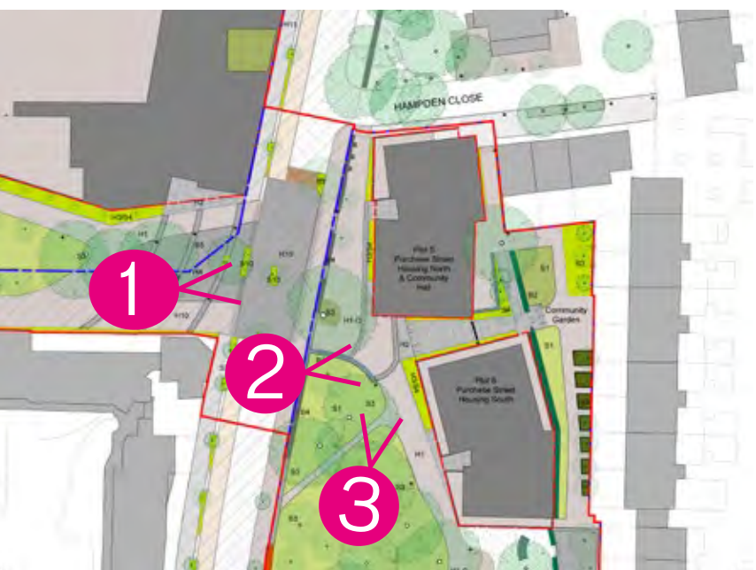
Key - View Locations