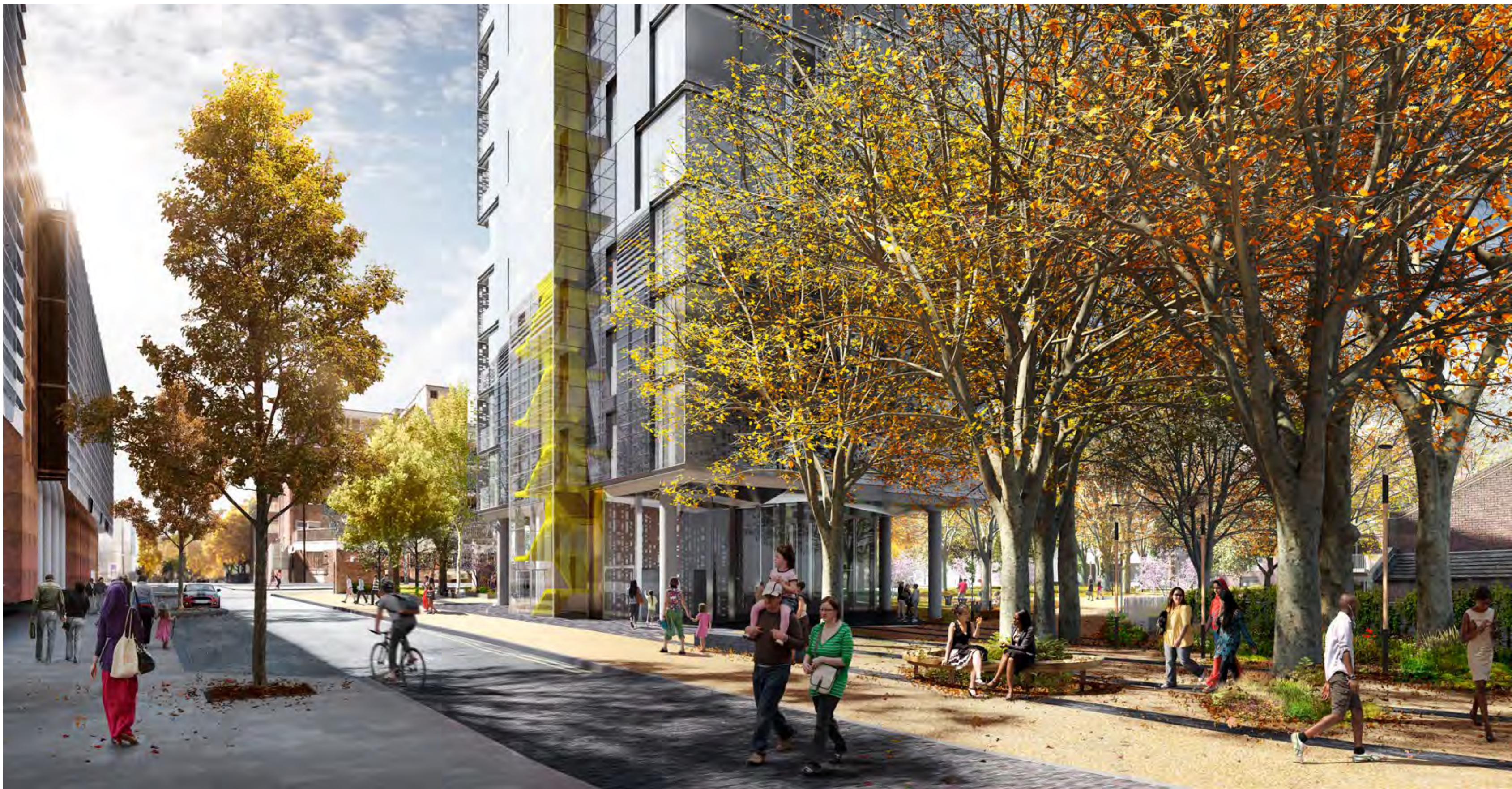
3 View from Coopers Lane Gateway

This view shows the new entrance to Purchase Street Open Space South when approaching from the corner of Brill Place and Midland Road. New planting and seating around the existing trees extends the atmosphere of the park towards the street.