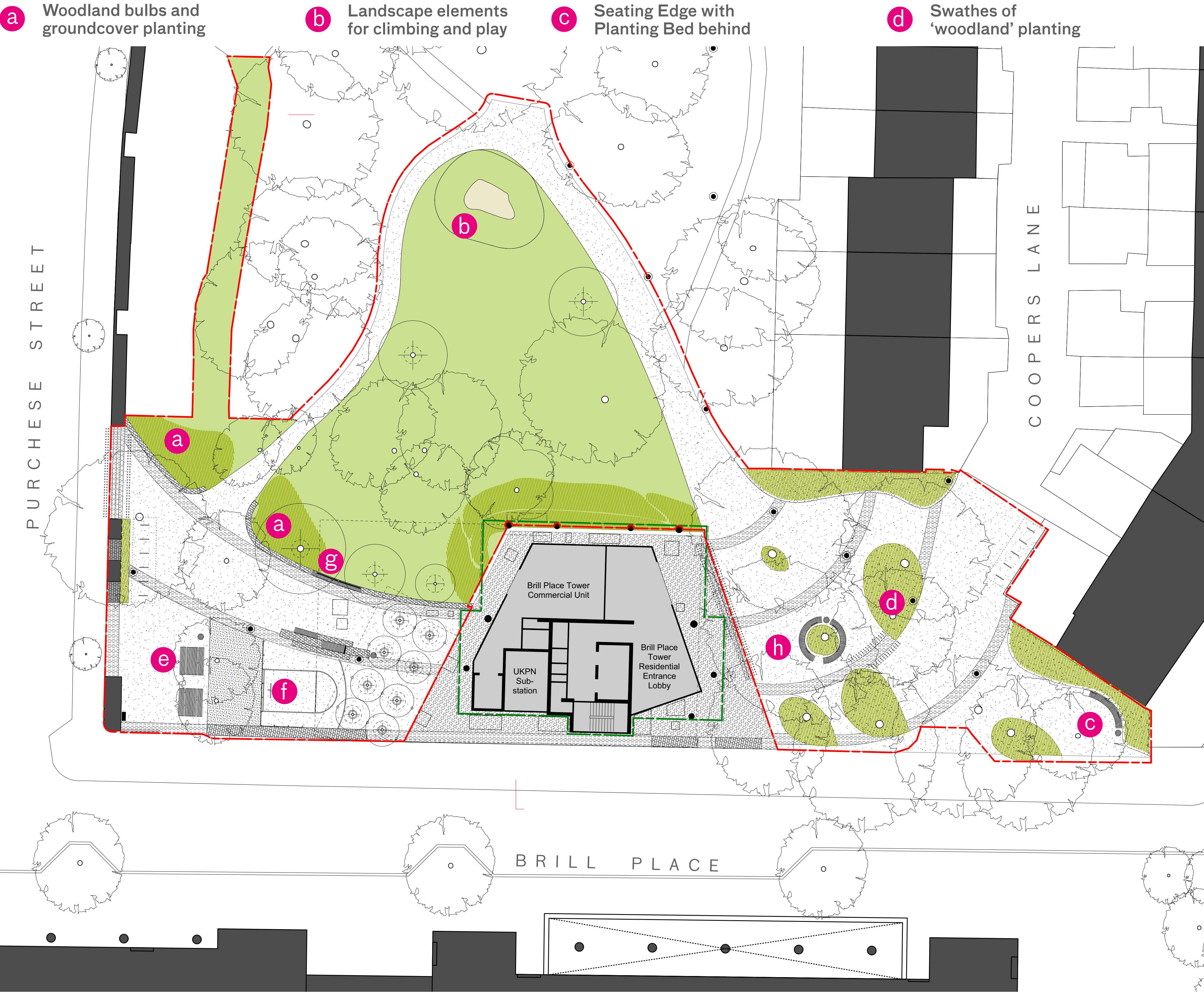
Proposed Landscape Plan