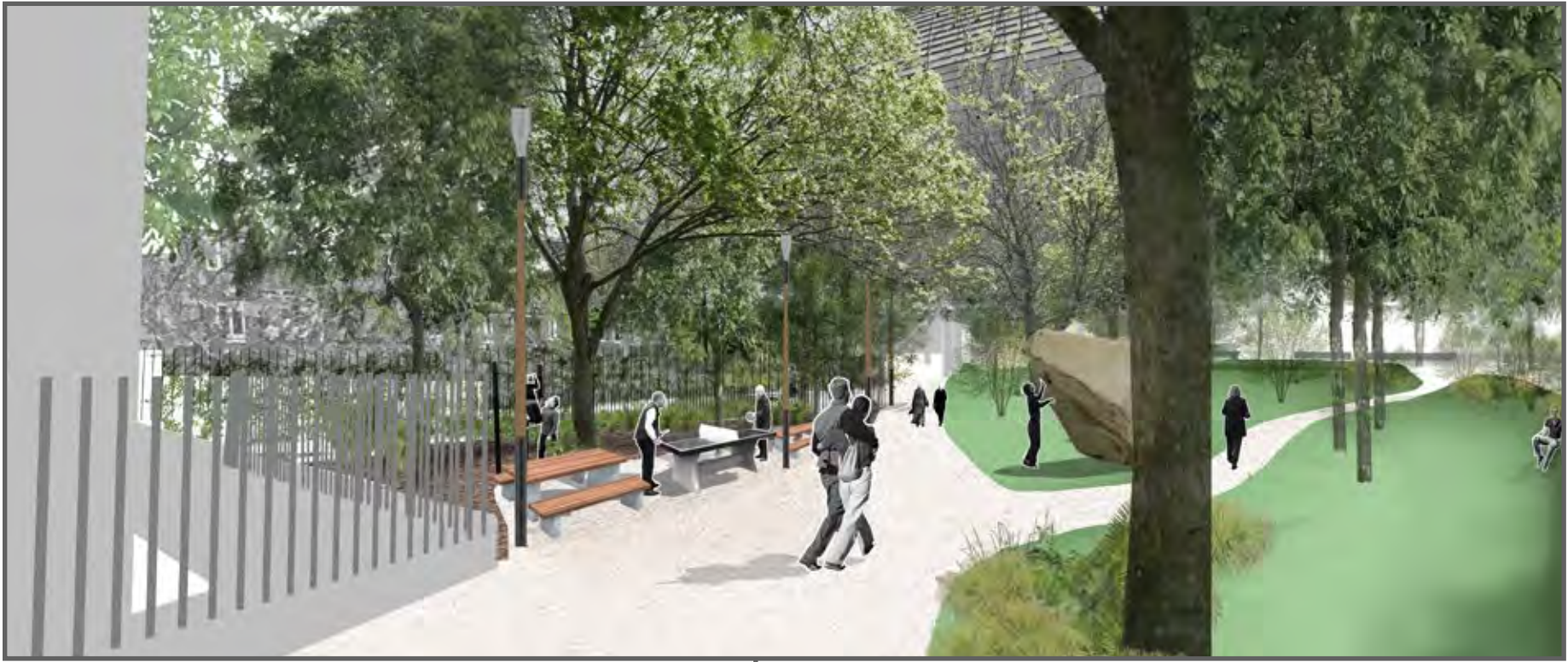
Purchase Street Open Space South

Landscape and public spaces are the drivers for the overall masterplan, rather than individual development plots, and the project will provide opportunities for the wider community including access to green spaces, shared social amenities and improved connectivity.