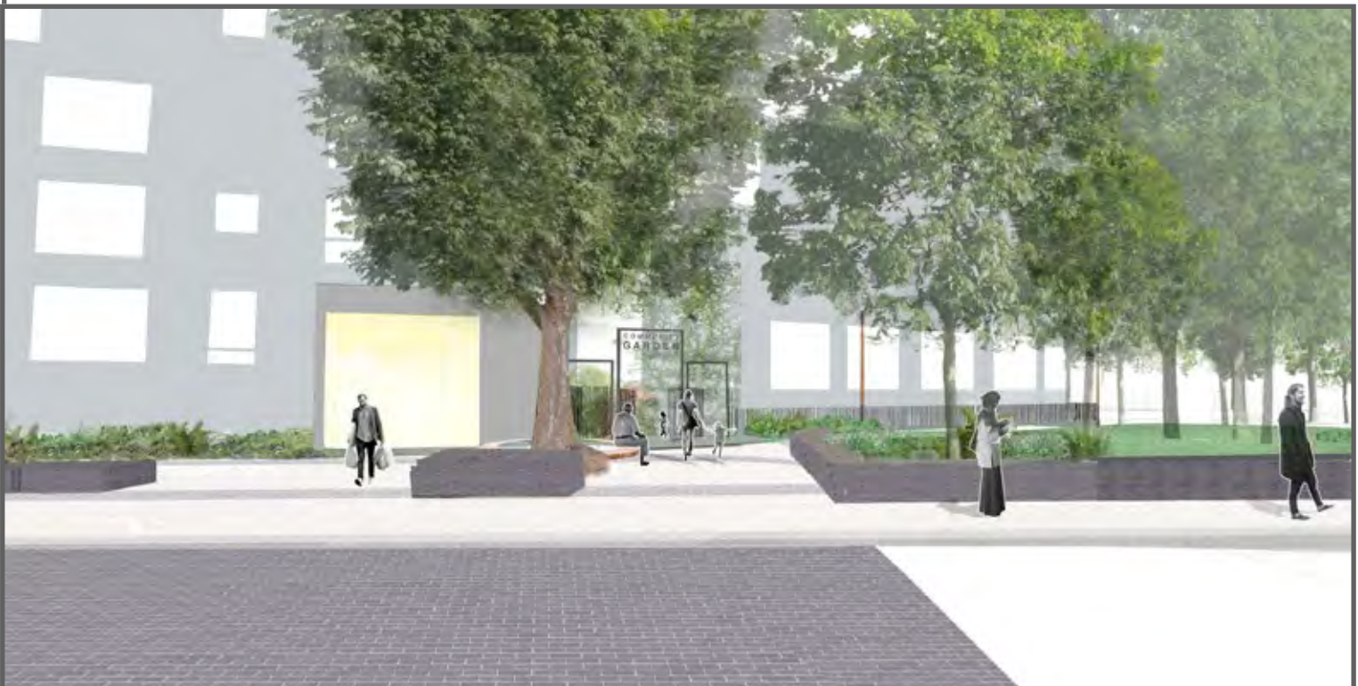
Community Garden Entrance