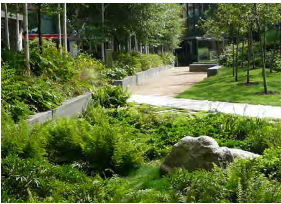
d Swathes of 'woodland' planting