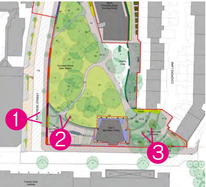
Key - View Locations