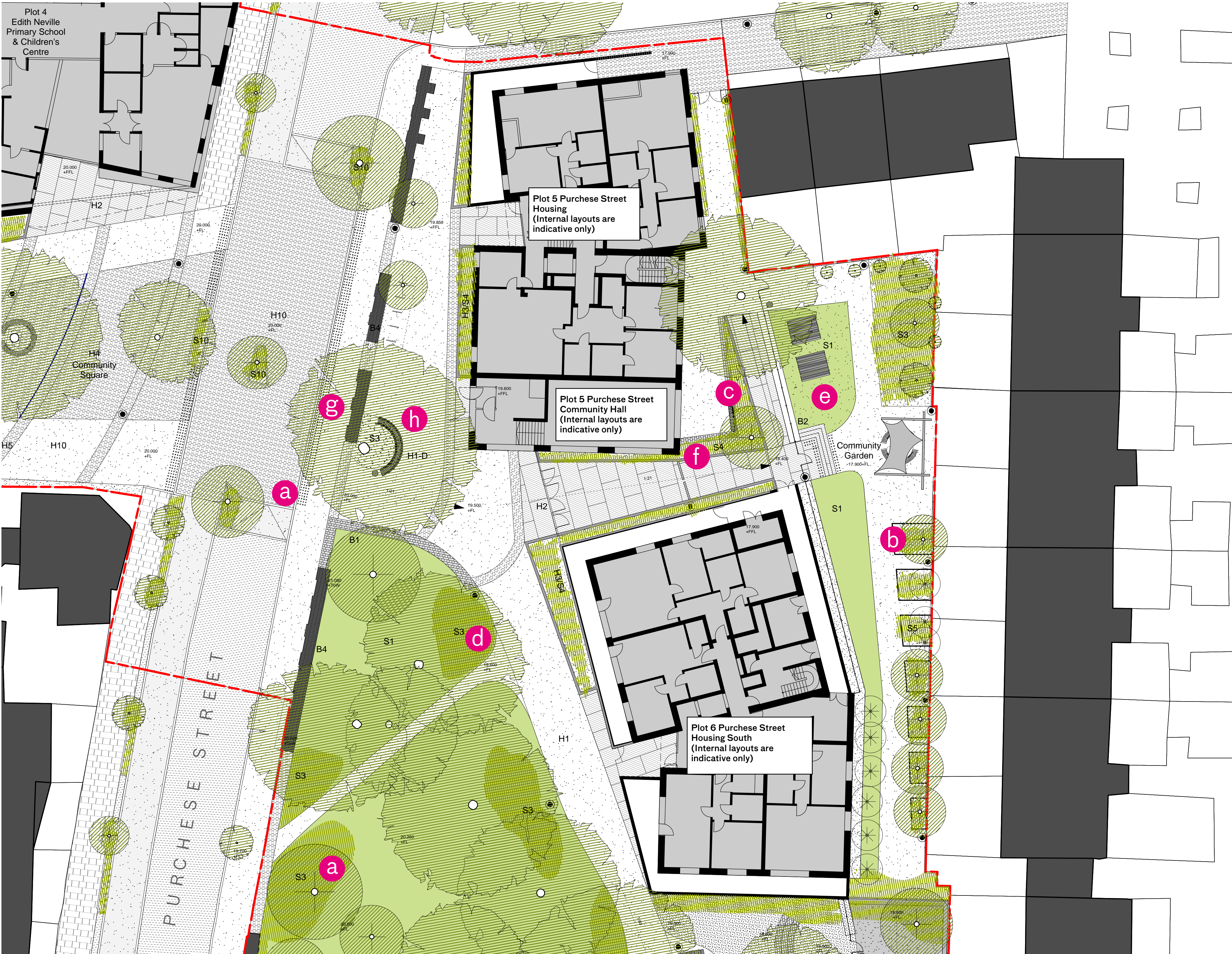
Proposed Landscape Plan