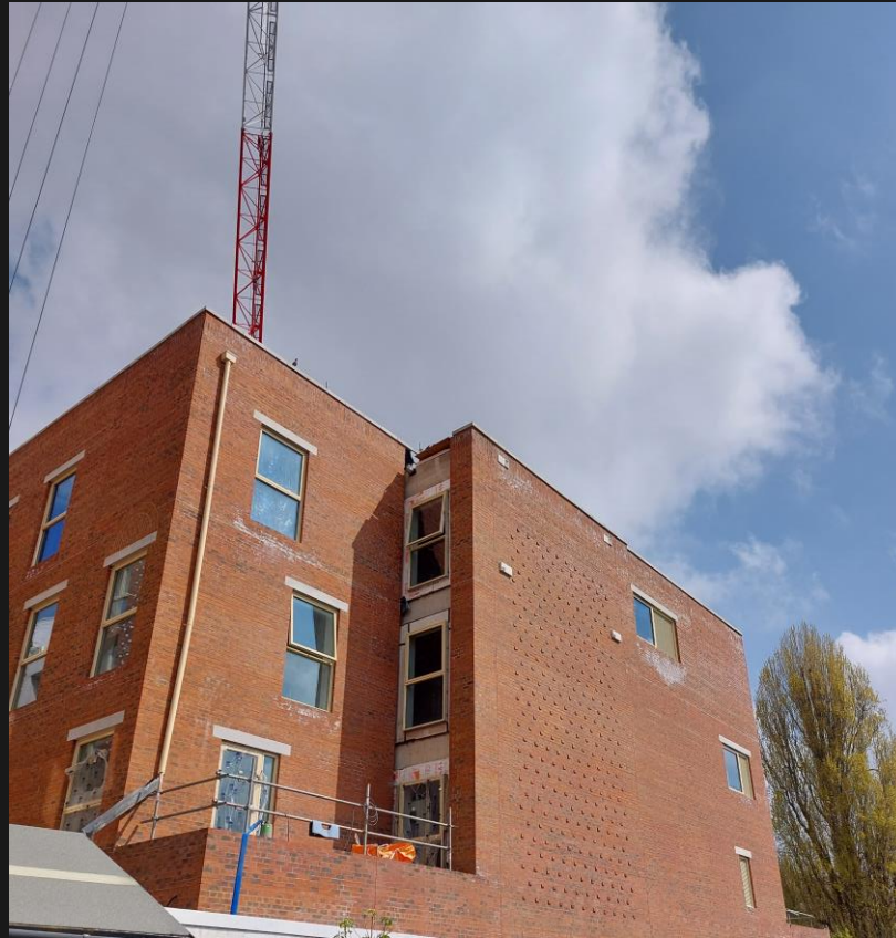
Block B – Façade