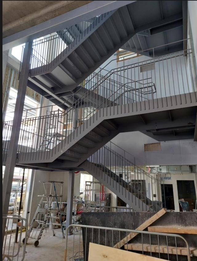
Block B – Feature staircase