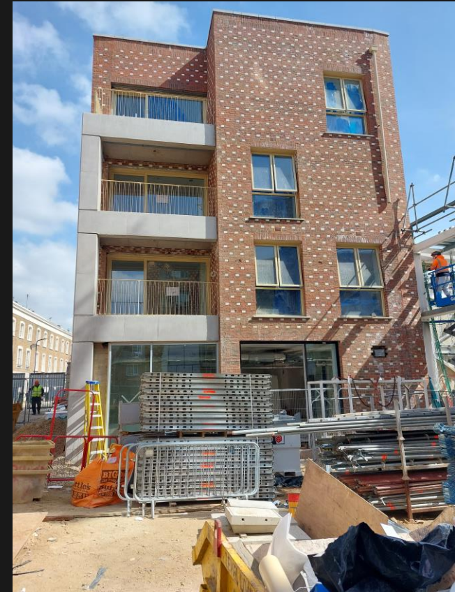
Block D – Façade