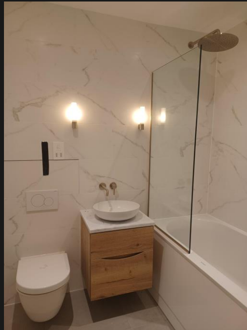
Block A – bathroom WIP