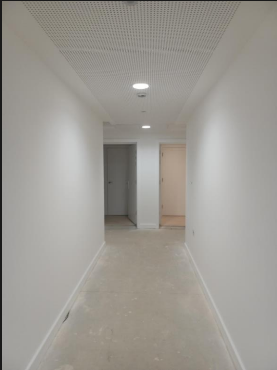
Block A – corridor