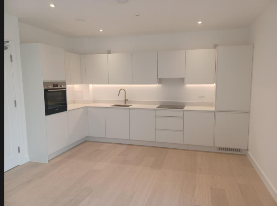
Block A – Kitchen