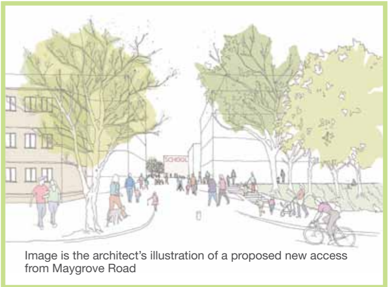
Image is the architect's illustration of a proposed new access from Maygrove Road

5pm to 8pm at West Hampstead library, Dennington Park Road NW6 1AU