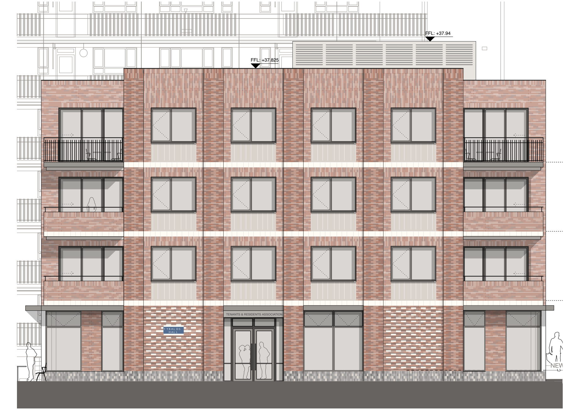
Block C elevation - looking from Tybalds Square