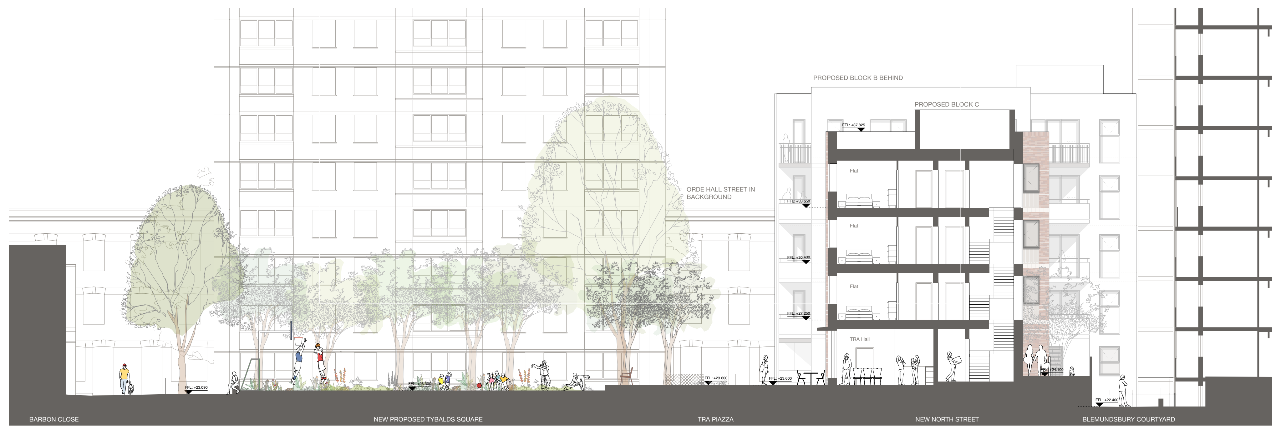
Tybalds Square section