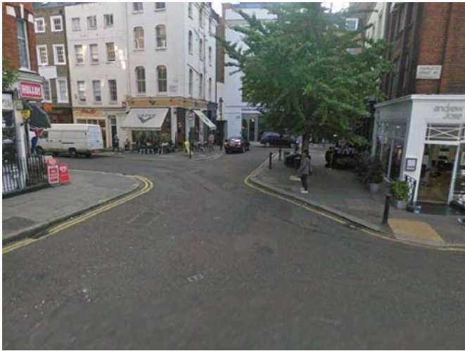
Charlotte Street / Percy Street / Rathbone Street