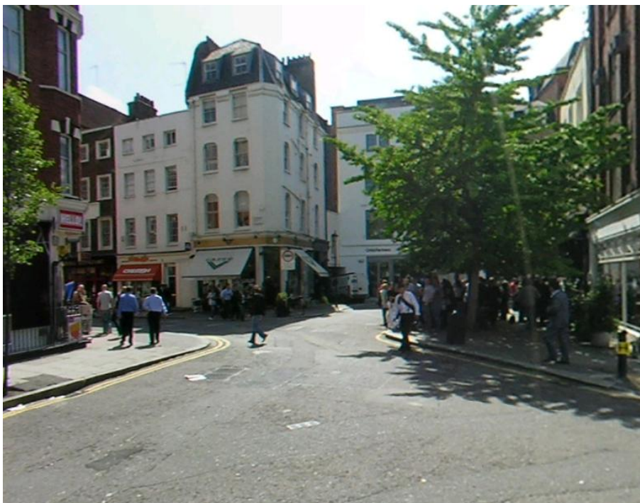
Charlotte Street / Percy Street / Rathbone Place / Rathbone Street junction

The proposals, which have been agreed with Westminster Council, are described in detail in the following pages with drawings. In addition to this key proposal, the Council will consider other improvements for the area such as repaving footways, installing Legible London signs, street lighting, new cycle parking, benches, raising parking bays and planting street trees.