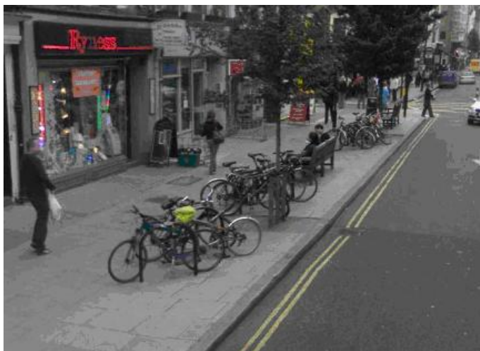
Cycle stands on Godge Street