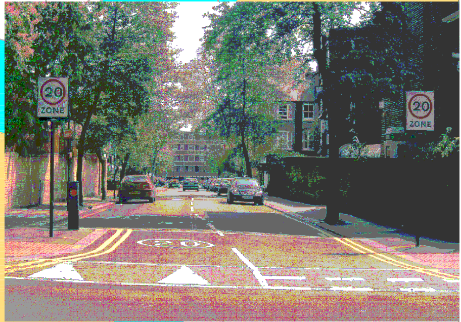
Example of a raised entry treatment