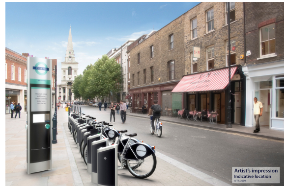
Photo showing example of bicycle docking hire stations.

Transport for London (TfL) is proposing to introduce a new cycle hire scheme in partnership with the 9 central London boroughs and the Royal Parks in the Zone 1 area of central London. The scheme will allow you to collect a bicycle from a docking station, use it for travel purposes, and then return it to any docking station. The scheme will offer an innovative addition to London's transport network.