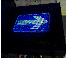
Example of a Variable Prism sign Example of a Variable LED sign