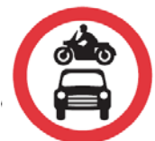
Diagram 1: Sign to prohibit motor vehicles

We are aware that some drivers find the existing closure confusing, and they do not understand the signs used. The current signage (shown in Diagram 1) is in the Highway Code and meets the Department for Transport legislation. However, some people do still drive through the closure when the restrictions are in place. To improve compliance, the Council would like to consult on the following options, but have included an option to leave the current arrangement as they are: