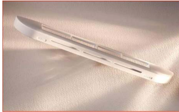
Trickle Vent