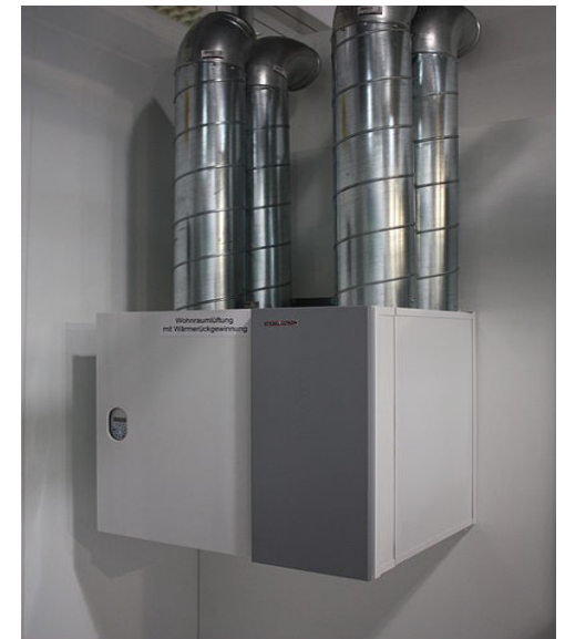
Mechanical Extract Ventilation (MEV) Unit