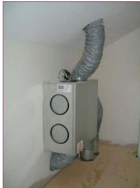
Mechanical Ventilation with heat recovery (MVHR) unit