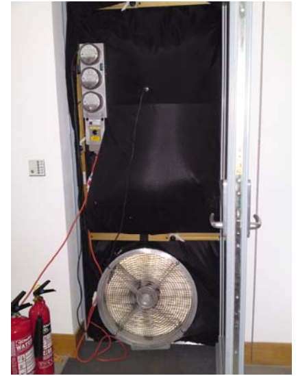
Fan pressurisation test equipment set up Picture credit: ECD Architects