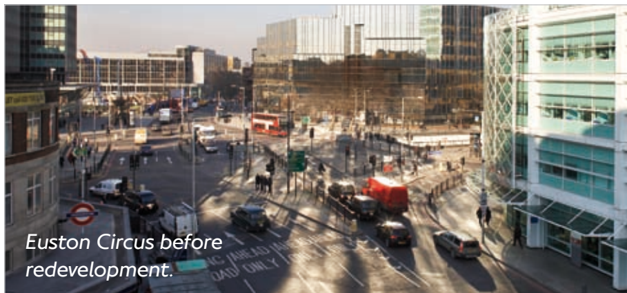
Euston Circus before redevelopment.

With the increased number of pedestrians and cyclists in London over recent years, TfL are working where possible to create a safe and pleasant environment to access local amenities such as the hospital and tube station. At Euston Circus, TfL are working with their partners on this project, the London Borough of Camden, Design for London and British Land, to provide improved facilities in anticipation of increased use of this junction due to proposed developments.