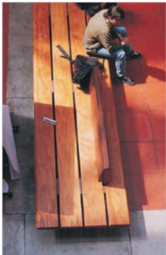
Proposed bench design.

We would appreciate your views on the proposed changes.