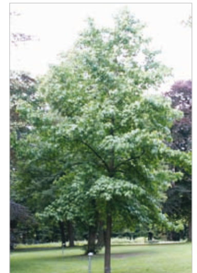
A Liquidamber tree which is going to be planted around the circus.