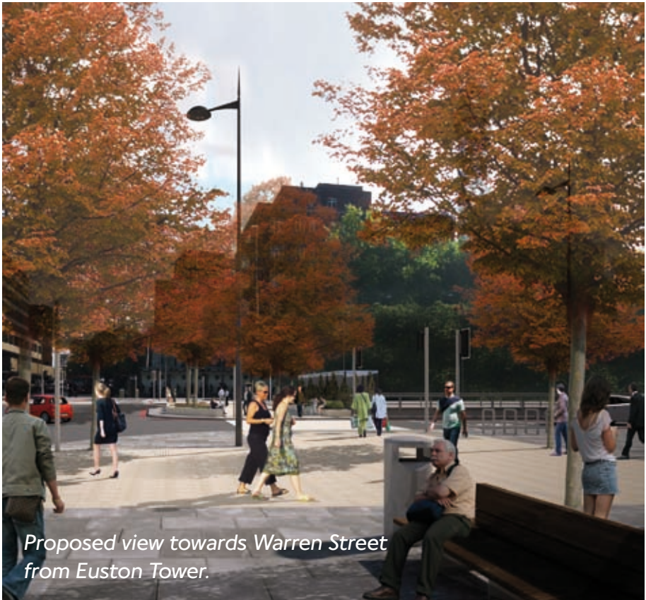
Proposed view towards Warren Street from Euston Tower.

We would like to know what you think of the designs. Please visit our website at www.tfl.gov.uk/eustoncircus and complete the online form. Alternatively write to us at Freepost RRZL-CUSK-AAEE, Consultation & Engagement Centre, Zone G4, 11th Floor, 197 Blackfriars Road, Transport for London, SE1 8NJ. Please let us have your view by 17 February 2012.