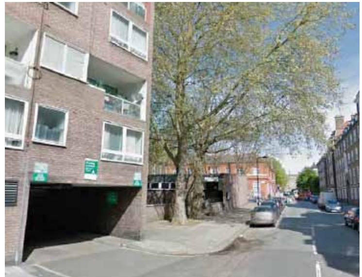
Site 5: Dick Collins Hall

Camden Council remains fully opposed to the government's proposals for HS2 in its current form but is continuing to work to reduce the negative impacts and get the best outcome for residents if it does go ahead. This has involved negotiating with HS2 on how we will rehouse affected residents, reviewing the needs of neighbouring residents and responding to HS2 consultations.