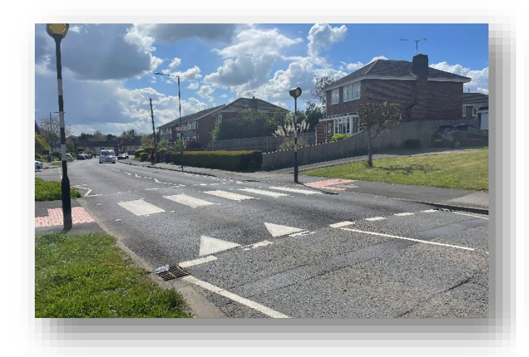
A parallel (pedestrian and cycle) crossing