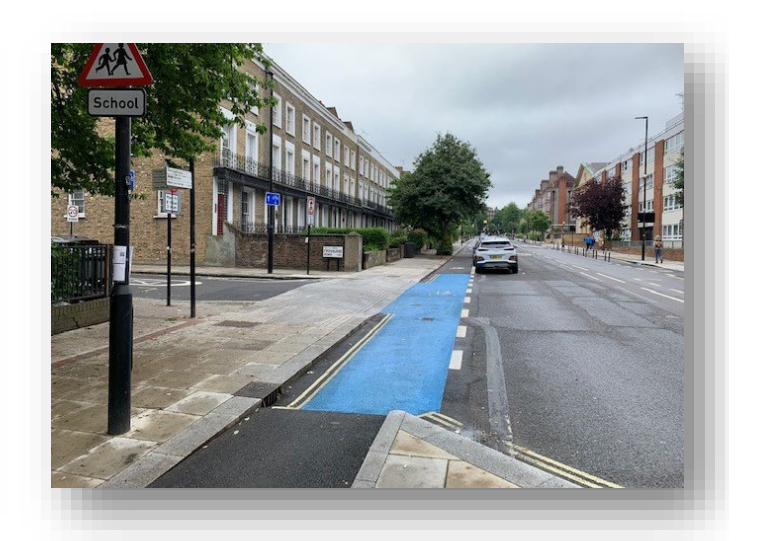
A shared use bus boarder with cycle lane