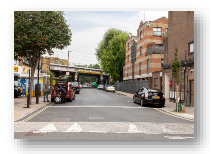
An advanced stop line / cycle box