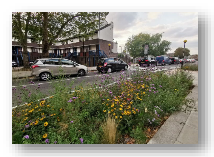
A tree in a pavement buildout/extension