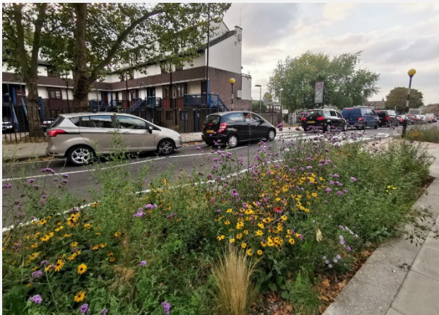
A tree in a pavement build-out/extension