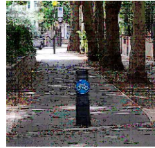
Cycle track resurfaced in 2022