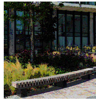
Area to be replanted by bio-diverse plant species