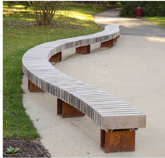
R&R Curved bench Streetlife BV