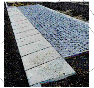
Example of Dutch-style entrance kerbs