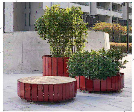
Example of Vestre STRIPES planters