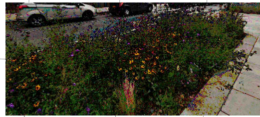
Example of SUDS scheme in Camden