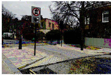
Example of traffic filter on raised table in Camden

Raised table paved with smooth granite setts