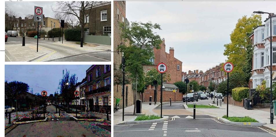
Recent similar schemes in Camden:

PARKING BAY LOSS SUMMARY Camden Square: 23m Cantelowes Rd: 5m North Villas: 21.5m Camden Terrace: 5.4m