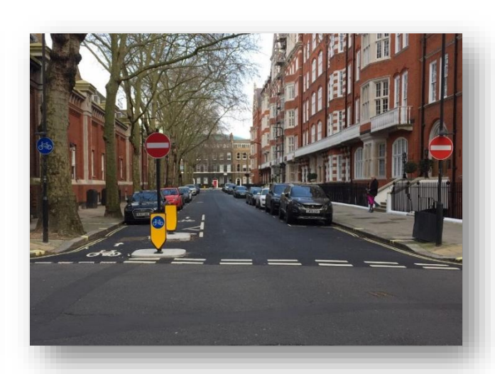
Floating parking bays with cycle lane next to kerb