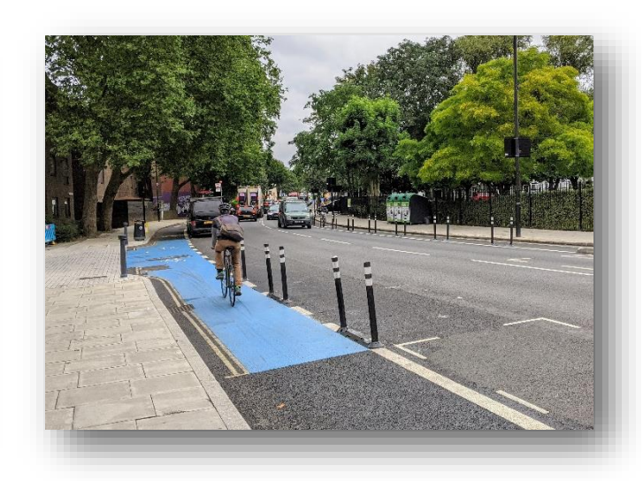
A shared use bus boarder with cycle lane