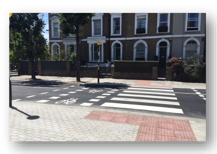
A kerb and wand segregated cycle lane