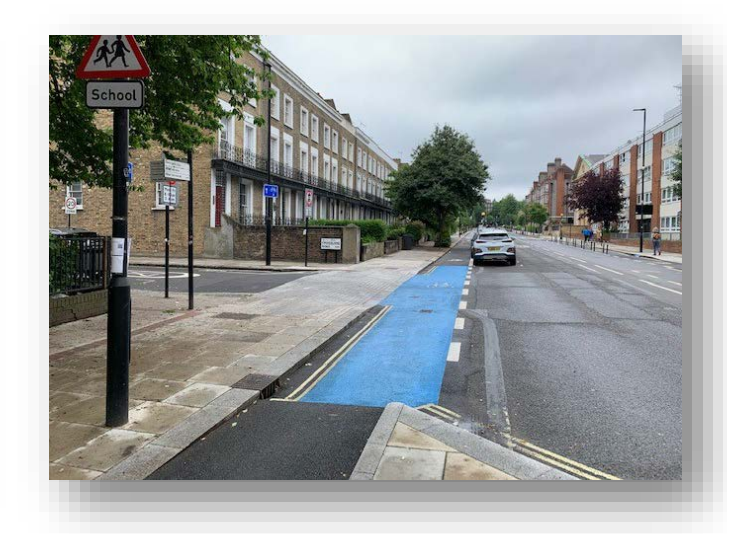
A shared use bus boarder with cycle lane