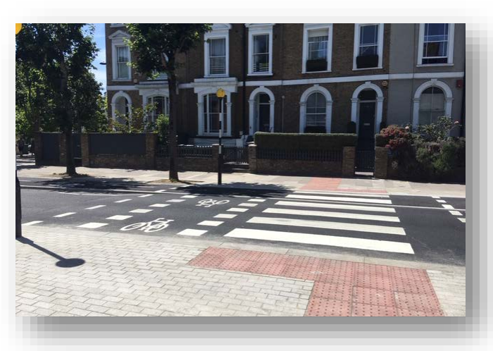
A kerb and wand segregated cycle lane