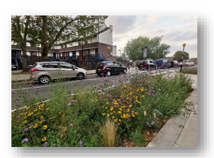
A tree in a pavement buildout/extension