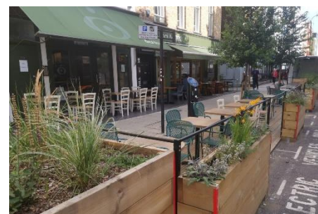
Streatory in Charlotte Street, Camden

To help the hospitality sector's recovery, we are reviewing the Streateries on Cleveland Street and will consider upgrading the current facilities with the same infrastructure seen at our other sites in Camden.