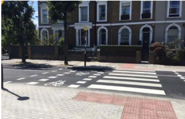
Parallel (pedestrian and cycle) crossing