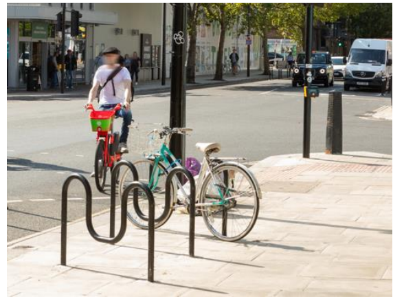
Cycle parking stands