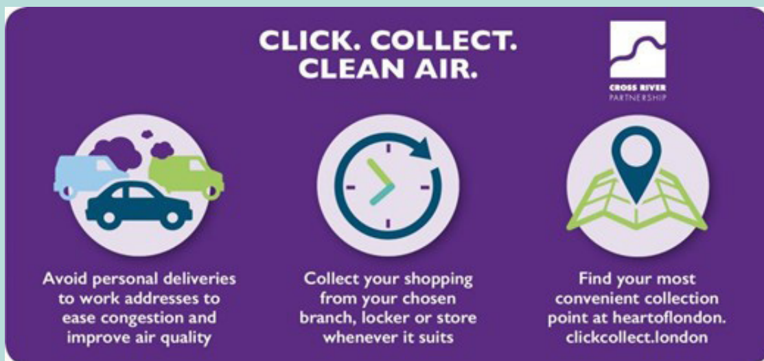
Figure 3: Cross River Partnership Communications material for Click. Collect. Clean Air. Campaign. 3

The scheme is deemed to provide valuable information and to be supporting the reduction in personal deliveries.