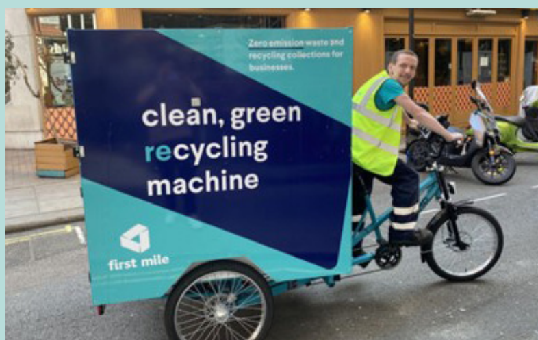
Figure 1: First Mile custom electric recycling bike 1 .

In 2022, First Mile has launched a custom-built electric bikes , which is now used to consolidate Grosvenor Estates waste and recycling.