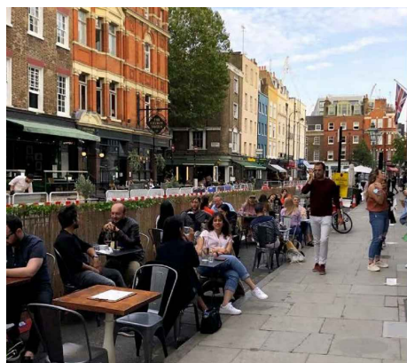
Representation of outdoor dining on new space

Freemasons' Hall (United Grand Lodge of England)