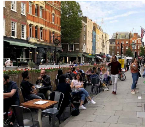
Representation of outdoor dining on new space

Provide area for outdoor dining on existing footway