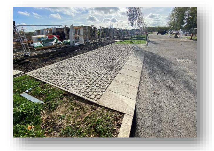
Setts These are granite setts.

Similar to a continuous pavement but there are concrete entrance stones.