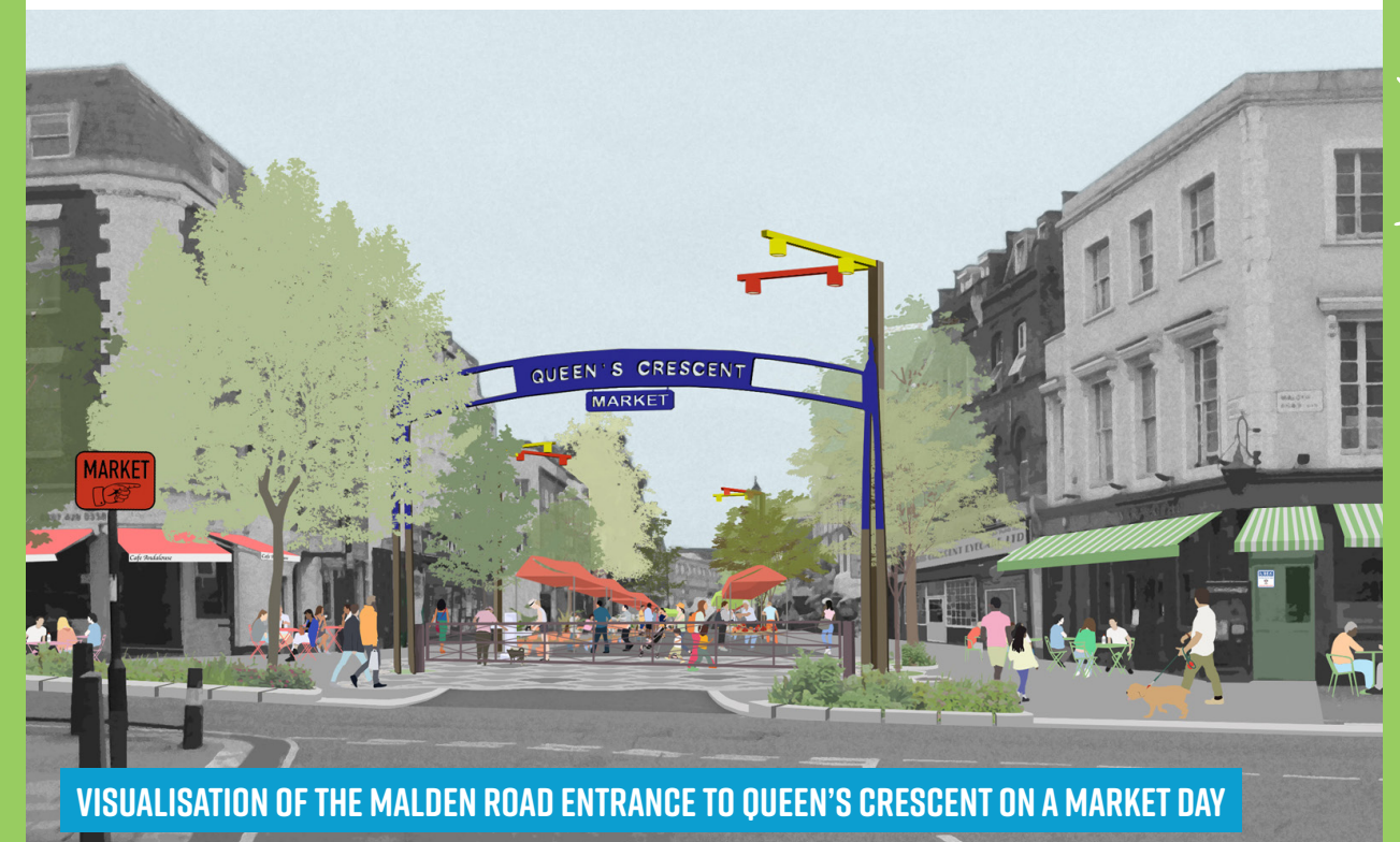
VISUALISATION OF THE MALDEN ROAD ENTRANCE TO QUEEN'S CRESCENT ON A MARKET DAY

Let us know what you think of the changes we're proposing. Please fill out the consultation - this should only take a few minutes - before March 18. After the consultation, a decision report that considers a broad range of information - including consultation responses, feedback received during the trial, relevant policies and monitoring data collected during the trial period - will be published on our website. Residents and stakeholders will be notified of the outcome. Please note that all plans and visualisations in this booklet are aspirational and subject to change in the scheme's final design.