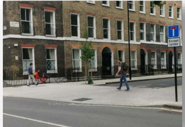
Continuous Footway / Pavement