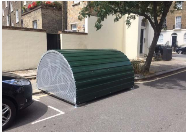
A bike hangar