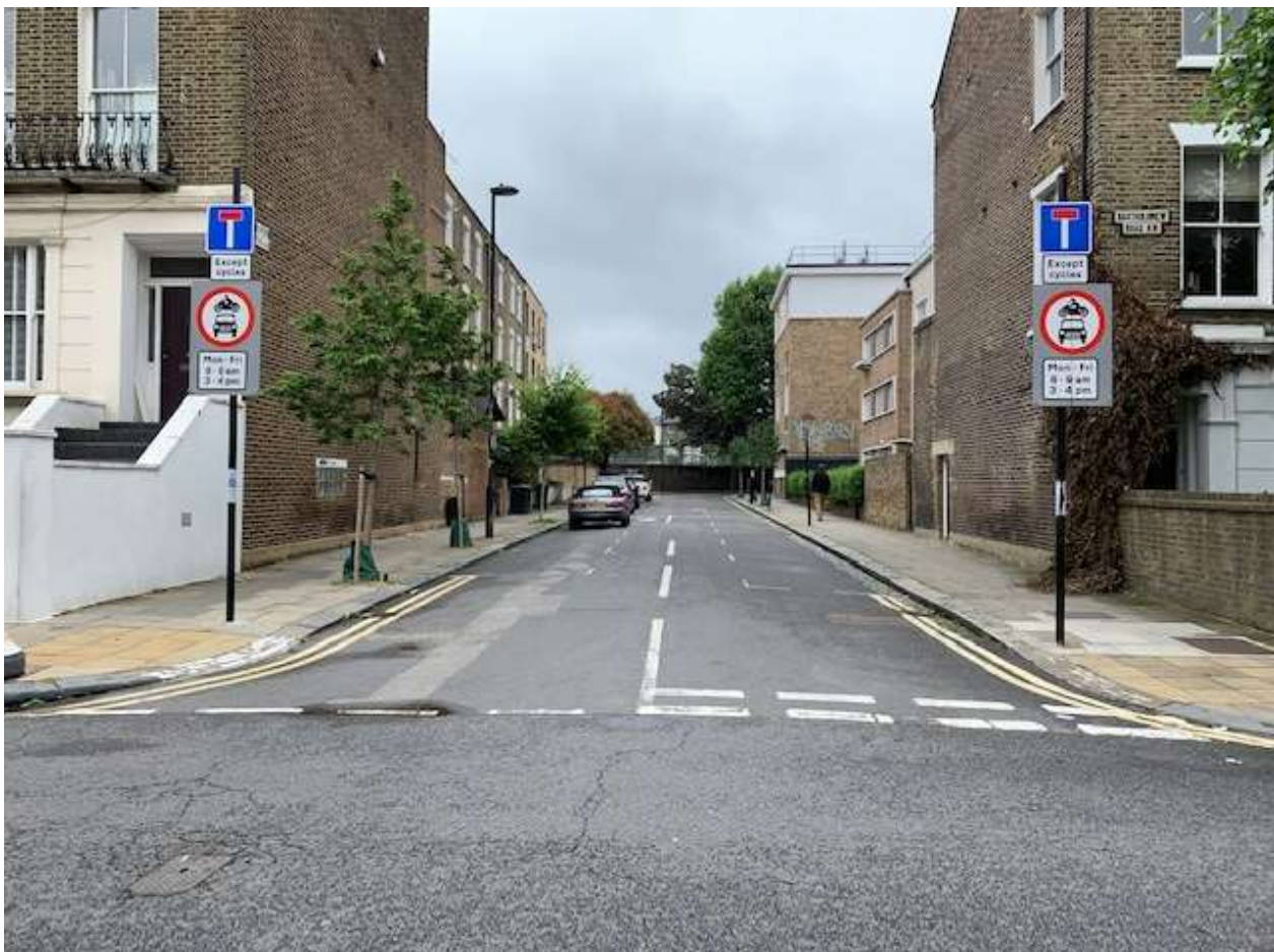
Photo of Camden School for Girls Healthy School Street viewed from Bartholomew Road