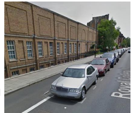
Example of 'floating' parking bay on Royal College Street, Camden.

The proposed improvements involve the introduction of a contra-flow (against the flow of car traffic) cycle lane on St Mark's Square that will allow cyclists to travel northbound safely along St Mark's Square. This will require the removal of one of the three existing traffic lanes along this road and all the existing parking bays will be moved and joined together to create one 'floating' parking bay that will be marked between the contra-flow cycle lane and southbound traffic movements. No parking spaces will be lost as a result of the changes proposed..