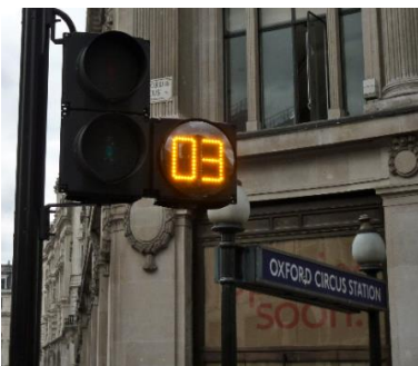
Example of 'countdown' pedestrian signals on Oxford Street

At the northern end of St Mark's Square the footway will be widened to improve access to the existing zebra crossing on Regent's Park Road. This will also reduce the crossing distance across St Mark's Square, and the central island will be relocated to better suit the new road layout.